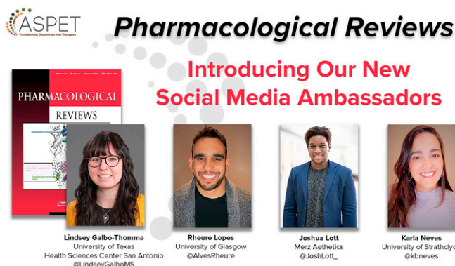
Fig. 1. 2022 Pharmacological Reviews Social Media Ambassador Inaugural Team.