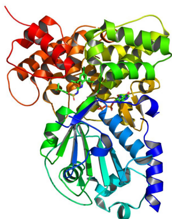
Human NLRP3 NACHT bound with ADP and NP3-146